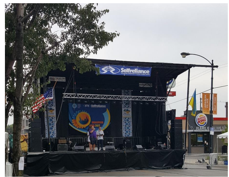
2017Sample Stage during setup