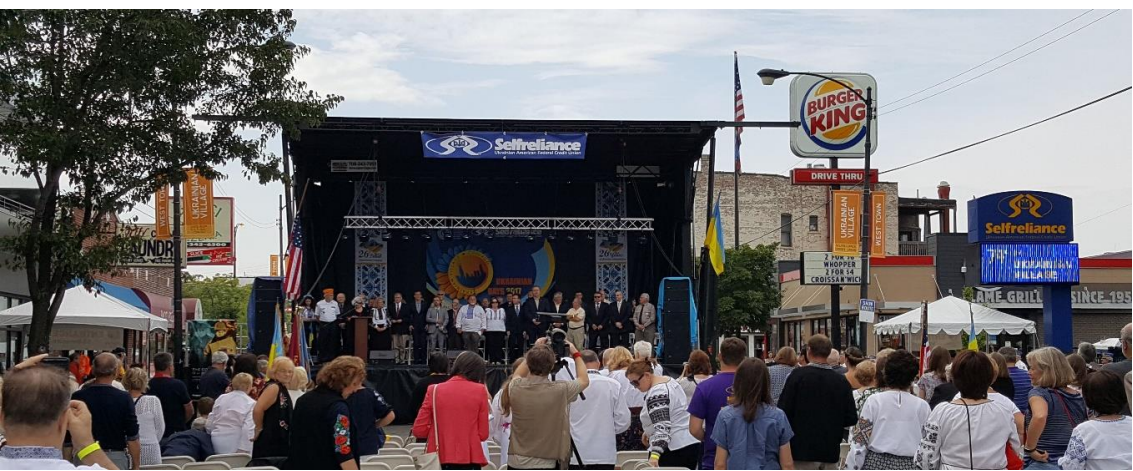
2017 Sample Stage during performance

Live scripted promotional plugs are included with stage branding for both Platinum and Gold sponsors. They are scheduled between performances on the main stage throughout both days of the festival.