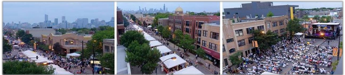
View of Ukrainian Days Festival 2017 spanning two city blocks on Chicago Ave.