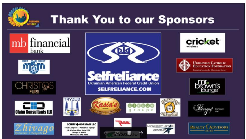
2017 Sample Sponsor Banner

A digital version of the sponsor banner is also circulated on social media via scheduled posts. All our affiliated pages and event pages on Facebook share the event's posts. The Ukrainian Days website will also have a page dedicated to our sponsors. The social media "Thank You to our Sponsors" campaign will begin circulating daily on August 1<sup>st</sup> 2019, almost an entire month before the event.